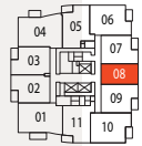
Level 8 & 16

571-574 interior SF 0 exterior SF 571-574 total SF